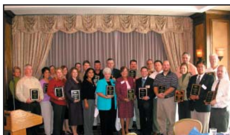
2006 Express Level Members